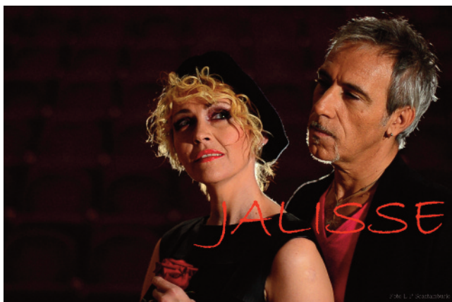
Jalisse Artistic Directors DOCMusiccontest